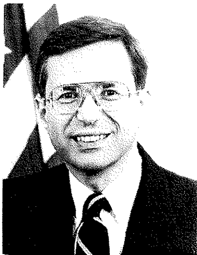
Dick Zimmer for U.S. Congress (New Jersey -District 12)