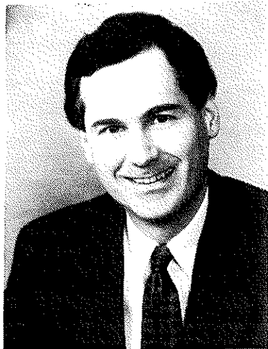
Tom McClintock for U.S. Congress (California, District 24)