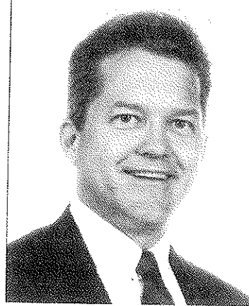
Sen. Mark Foley

Foley sponsored the volunteer immunity act (S112) that protects volunteers from personal liability while engaged in their volunteer duties. He also sponsored legislation that would protect